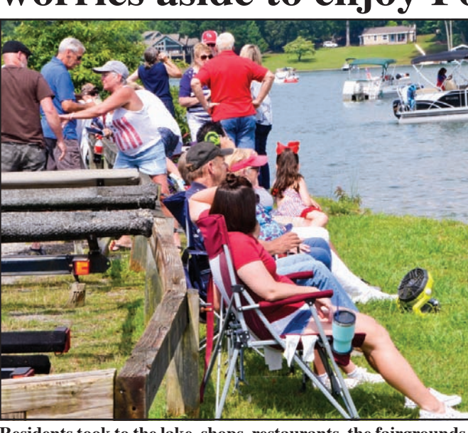
Residents took to the lake, shops, restaurants, the fairgrounds, the beach and plenty other local spaces in celebration of Independence Day Saturday.

By Jarrett Whitener Towns County Herald Staff Writer Even though the topics