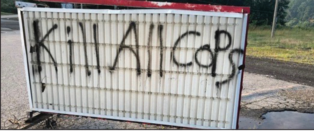
Someone spray-painted "Kill All Cops" and similar ideological messages on various surfaces along US 76 between Sunnyside Road and Papa's Pizza To Go over the weekend.