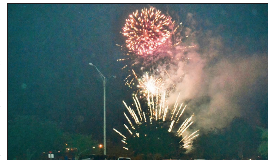
The Georgia Mountain Fairgrounds did it again in 2020, hosting a fantastic fireworks display for area residents.